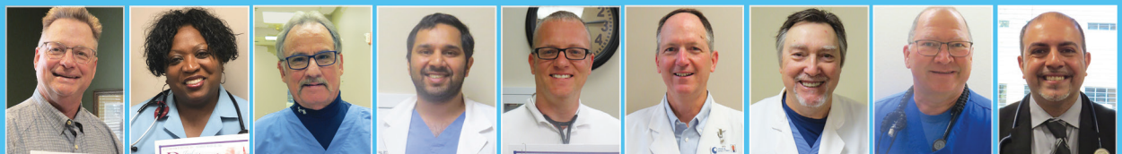
Physicians who were recognized for their care during Doctors' Day 2019!