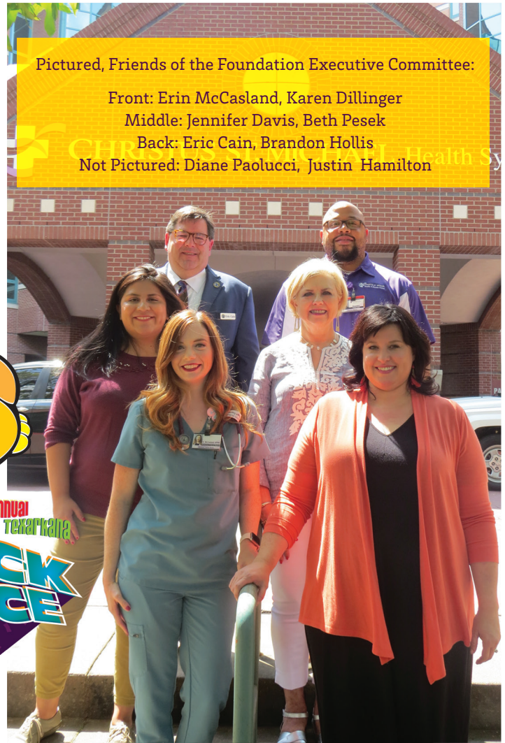
Pictured, Friends of the Foundation Executive Committee: